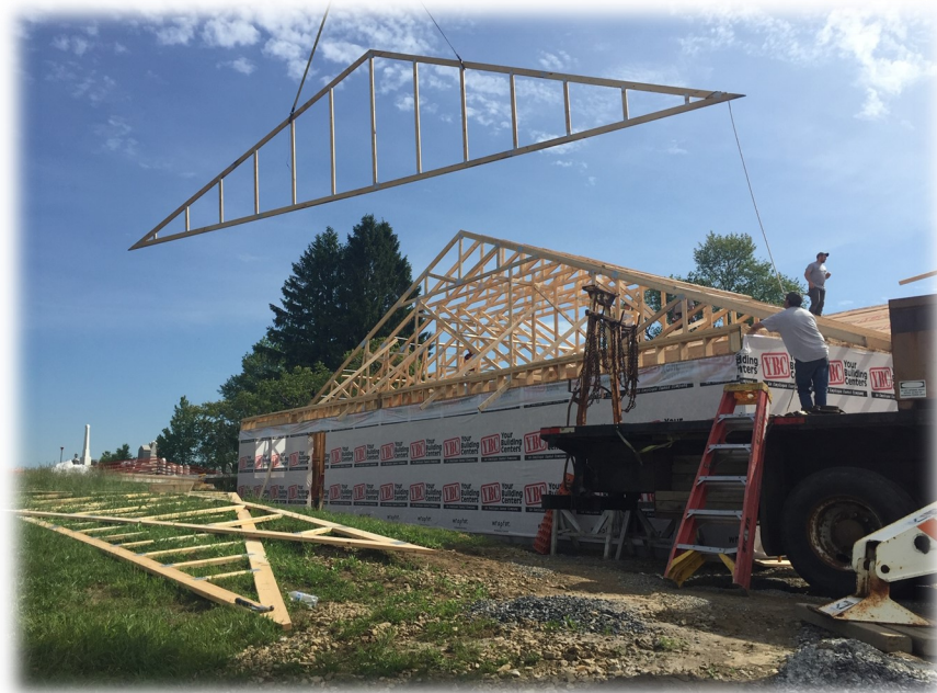
Guardian Angel Center Addition