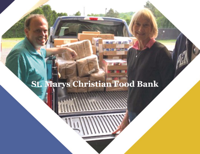
St. Marys Christian Food Bank