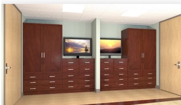
Proposed resident room renovations at Pinecrest Manor