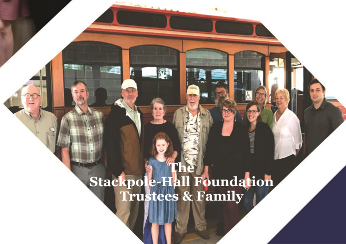
The Stackpole-Hall Foundation Trustees & Family